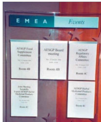
AESGP meetings held in the EMEA premises on 22 January 2004

This conference, held in cooperation with the European Medicines Agency, formed the follow-up to many constructive interactions with the European agency in charge of the evaluation of medicinal products since its foundation in 1995. Part of this cooperation was the support provided by AESGP in the organisation of two conferences in the framework of the Pan European Regulatory Forum (PERF), in Budapest in February 2000 and in Ljubljana in July 2003. Both events made important contributions to a smooth preparation of the enlargement process, which allowed the self-medication industry to be well prepared for the entry of ten new Member States on 1 May 2004. The important legislative and regulatory parameters (classification of medicines as prescription or non-prescription, advertising of all non-prescription medicines and free pricing for manufacturers) were established